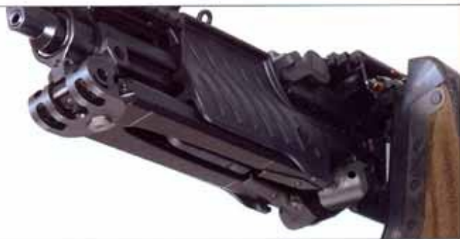
ERGONOMICALLY OPTIMISED BIPOD SOLUTION

Heckler & Koch set the standard for durability of barrels. At the same time, changing the MG4 E barrel could not be easier. Significantly it can be changed without using gloves, because the carrying grip is also the barrel change grip. This advantage comes into effect when the first barrel has heated up as a result of combat shooting. An additional key advantage: In the MG4 E, the barrel can be changed independently of the bolt position.