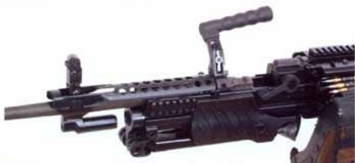
SIMPLE AND QUICK BARREL CHANGE

A MACHINE GUN CAN MAKE MANY PROMISES. WHAT COUNTS IS THAT IT IS ABSOLUTELY RELIABLE IN COMBAT SITUATIONS. FEW MANUFACTURERS TEST THEIR NEW WEAPONS AS THOROUGHLY AS WE DO IN COOPERATION WITH THE USERS WHO WILL CARRY THEM LATER ON IN A MISSION.