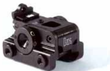
MECHANICAL SIGHT (OPTIONAL)

Height- and windage-adjustable: Distance adjustable to 1000 m. In addition, optical sights can also be adapted without removing the pre-mounted mechanical sight.