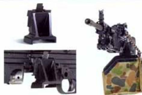
ADAPTER FOR THE NATO STANDARD 200-CARTRIDGE BELT BOX AND 200-CARTRIDGE BELT POUCH (FOR MORE FREEDOM TO MOVE)

Used for attaching box and pouch centrally below the MG4 E. They can also be attached laterally without an adapter.