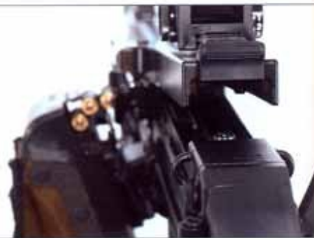
(RE-)LOADING WITHOUT CHANGE IN POSITION

The MG4 E is ready for use with the butt stock retracted. If, in addition, the barrel is removed the MG4 E is even more compact and with the rear sight folded down presents the minimum size for easy stowage and transportation.