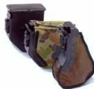
BELT POUCHES 100/200 CARTRIDGES 200-CARTRIDGE BOX

Height- and windage-adjustable: Distance adjustable to 1000 m. In addition, optical sights can also be adapted without removing the pre-mounted mechanical sight.