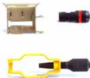
BLANK FIRING ATTACHMENT AND BLANK FEED TRAY FOR BLANKS

The heat shield can be slipped onto both the short and the long barrel.