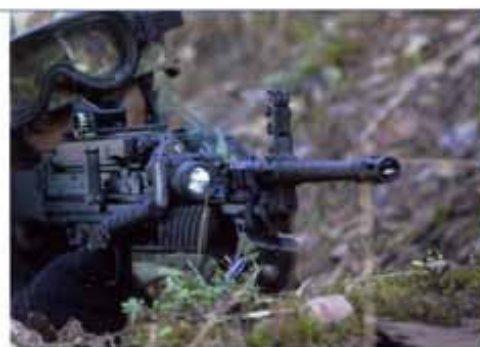
LOW SMOKE DEVELOPMENT

The bipod of the MG4 E is robust and dirt resistant. It can be simply folded up and stowed away in the ergonomically formed handguard. This allows the user to hold and transport the MG4 E as comfortably as an assault rifle. It can be rotated and has variable height adjustment—absolutely necessary for uneven terrain in combat situations.