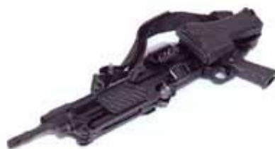
EASY TO STOW AWAY, EASY TO TRANSPORT

An additional strength of the MG4 E: With other machine guns, heavy smoke development often impairs the user's vision or irritates his eyes when shots are fired in rapid sequence. The MG4 E overcomes this—it develops only a small amount of smoke whose escape is controlled towards the rear.