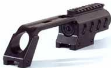
TELESCOPIC SIGHT, MAGNIFICATION 3-FOLD (INTEGRATED PICATINNY RAIL AND MOUNTING OPTION FOR NSA 80)

Used for attaching box and pouch centrally below the MG4 E. They can also be attached laterally without an adapter.