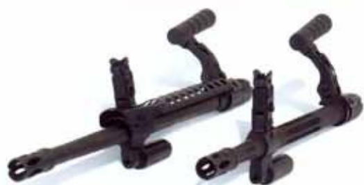
SHORT AND LONG BARREL/ADDITIONAL PROTECTION THROUGH HEAT SHIELD

WE HAVE DEVELOPED A RANGE OF ACCESSORIES, ALL FINE TUNED TO WORK TOGETHER TO ENSURE THE MG4 E DISPLAYS ALL THE STRENGTHS OF A PERFECT WEAPON SYSTEM.