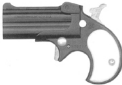
MODEL C22, C22M, C25, AND C32